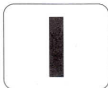
Fig. 1. Line should be a quarter inch thickness